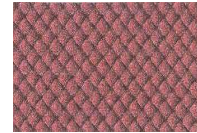
Carbonium Red FP-1101 *