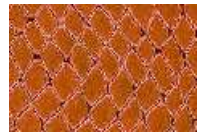
CopperHead FP-1161 *