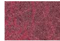
Red Marble FP-1181 *