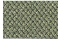
Carbonium Gold FP-1091 *