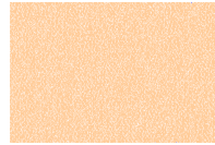
Beige Denim FP-1071 *