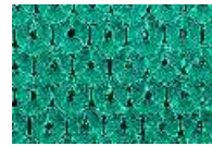
Green Spangle FP-1171 *