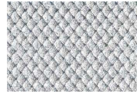
Carbonium Silver FP-1081 *