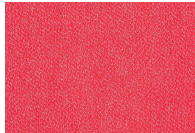
Red Denim FP-1061 *